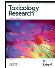
Toxicology Research Journal