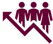
Society's Annual Congress, workshops, webinars and Public Statements