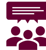
Community of experts across all sectors